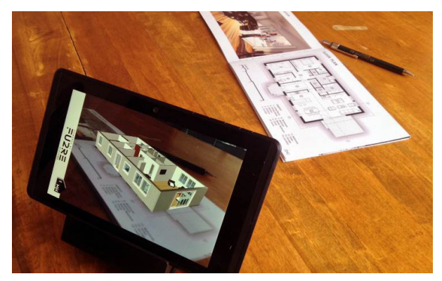
Figure 3. Mobile application testing

Created android application is tested using "LG Nexus 5X" mobile phone and "Project Tango" tablet combining with appropriate markers. After starting the application, the device camera records real surrounding, while the application is searching for predefined markers. When the application detects and recognise certain marker on the device display, we can see additional content. Moving the marker will cause a joint move of both the marker and the additional digital content on the device display (Figure 3).