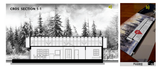
Figure 7. MH Petra: a) Cross section (marker); b) Augmented Reality presentation of section with 360° button

By pressing a 360 button, the user is transferred to second Virtual Reality part of the application which present 360 degree spherical panoramic images of the house interior. Virtual Reality presentation allows users of mobile devices to interactively "be inside of the interior and look around" with the full realism that digital photorealistic render can provide (Figure 8). Moving and rotating of device causing movement and rotation of a virtual scene on display in the same manner.