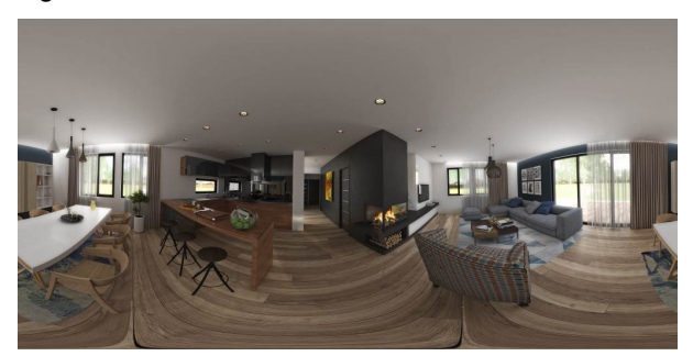
Figure 2. Spherical Virtual Reality texture of interior