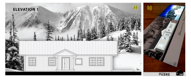
Figure 6. MH Petra: a) Elevation (marker); b) Augmented Reality presentation of elevation as 3D model

In the case of cross section (Figure 7-a) which is used as an Augmented Reality marker, created a mobile application display more detail and colourful floor plan (Figure 7-b) with 360° button. In this way, the user can perceive detailed cross section and go to the second, Virtual Reality part of application by typing 360° button.