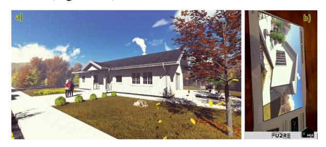
Figure 9. MH Petra: a) Perspective render visualisation (marker); b) Augmented Reality presentation video animation of house and its surrounding

If the device camera detects perspective render visualisation (Figure 9-a) as a marker, on the display of device we can see video which is connected with the marker (Figure 9-b).