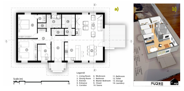
Figure 5. MH Petra: a) Floor plan (marker); b) Augmented Reality presentation of detail floor plan 3D model

Similar approach is used for floor plan (Figure 5-a) which is used as Augmented Reality marker in this case. When created mobile application detects the location of the marker (Figure 5-a), on the display of the device we can see a 3D model of detail floor plan connected with marker (Figure 5-b). In this way, the user can perceive the spatial appearance of the entire floor in detail together with furniture.